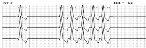
Brief SVT presumably during sleep